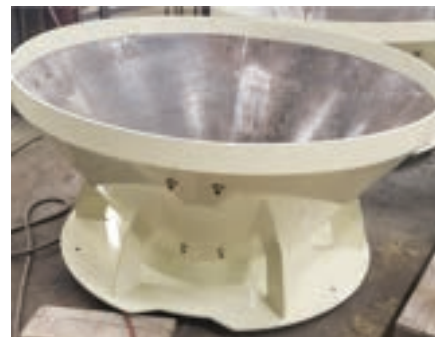
FEED CONE REPLACABLE LINER