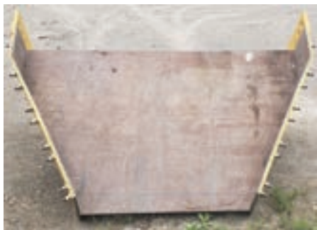
CHUTE DISCHARGE LIP