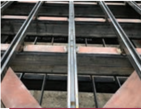
SCREEN DECK PROTECTION PLATES