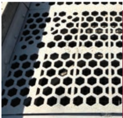
PUNCH PLATE SIDE TENSION