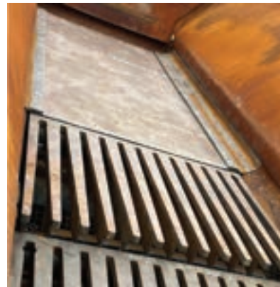
FEEDER FLOOR AND GRIZZLY