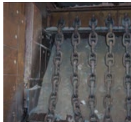
IMPACT CRUSHER SIDE LINERS