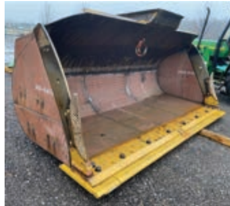
LOADER BUCKET LINER