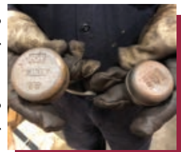
HW22BP34 & HW22DF46